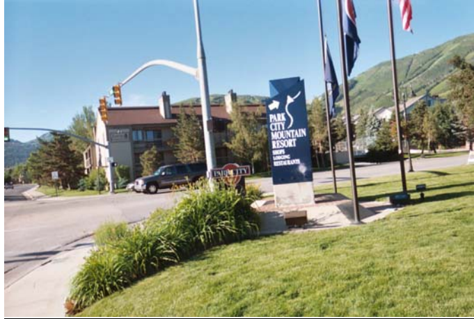
Northwest corner of Deer Valley Dr. and Empire Ave.

Looking South on Deer Valley Drive coming into town