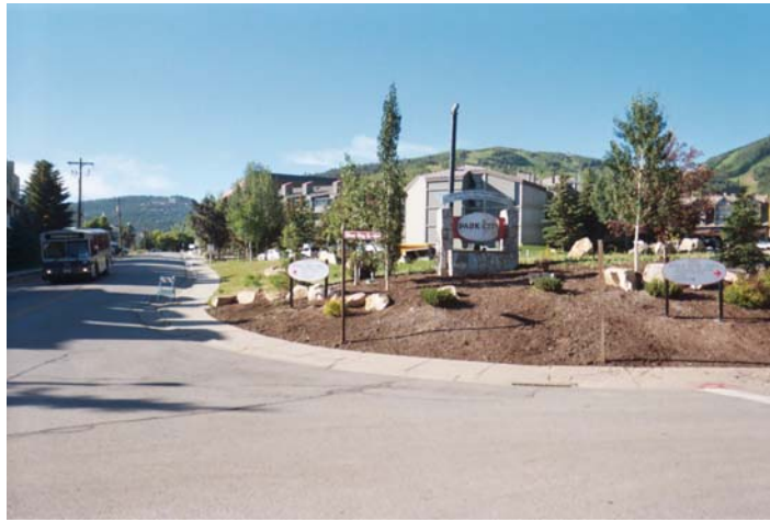
Southwest corner of Empire Ave. and Silver King Dr.