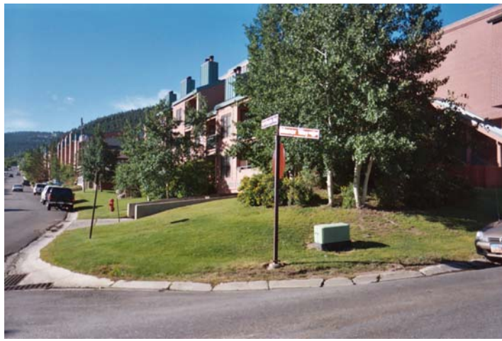
Southwest corner of Empire Ave. and Manor Way