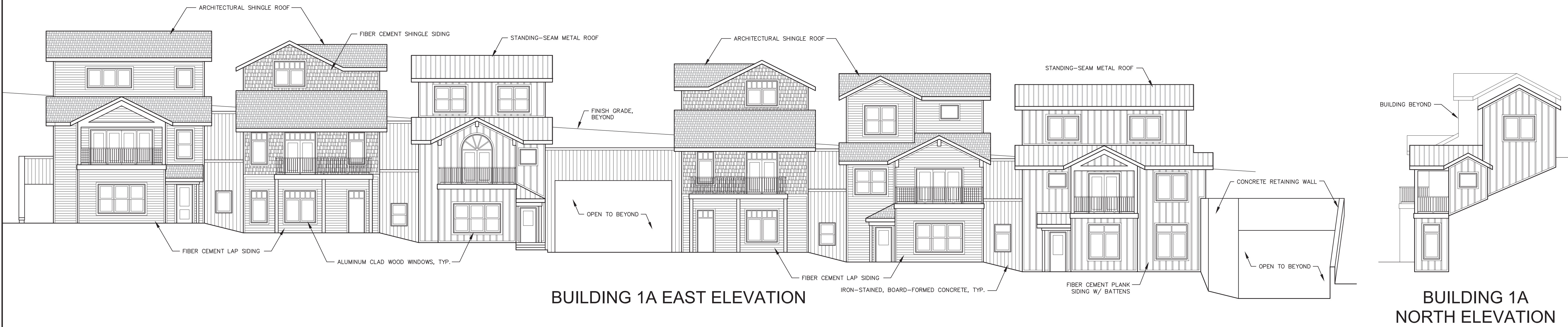
BUILDING 1A EAST ELEVATION