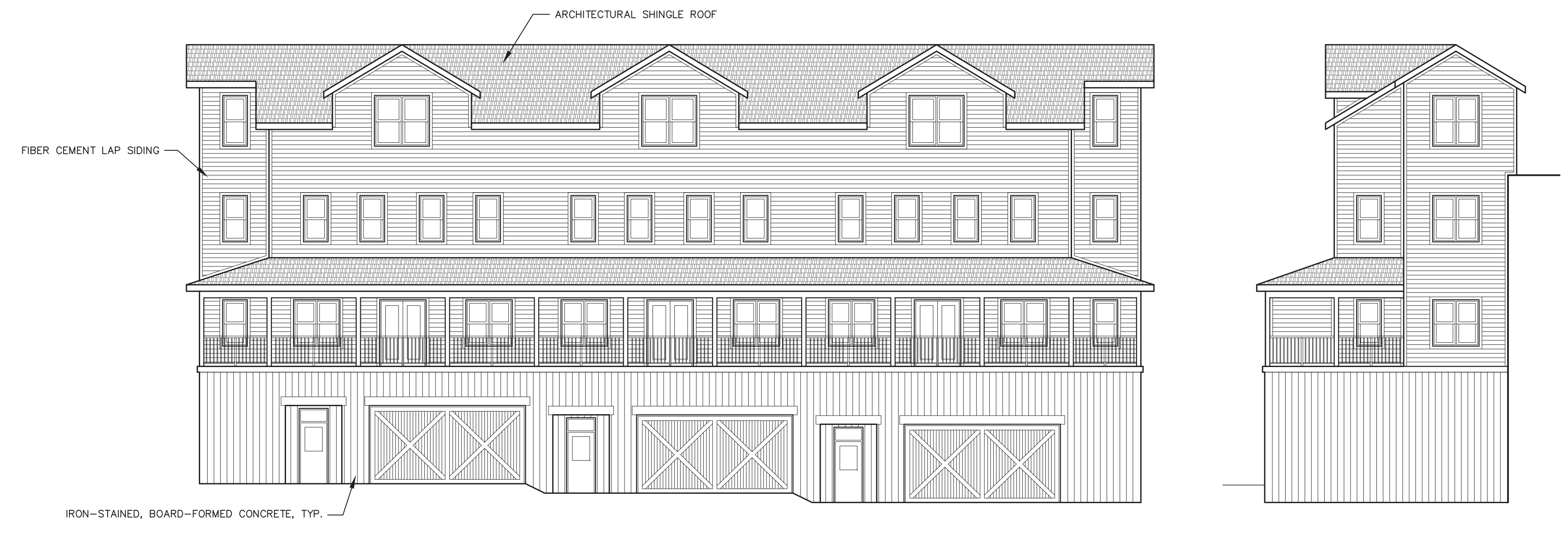
BUILDING 2 NORTHEAST ELEVATION