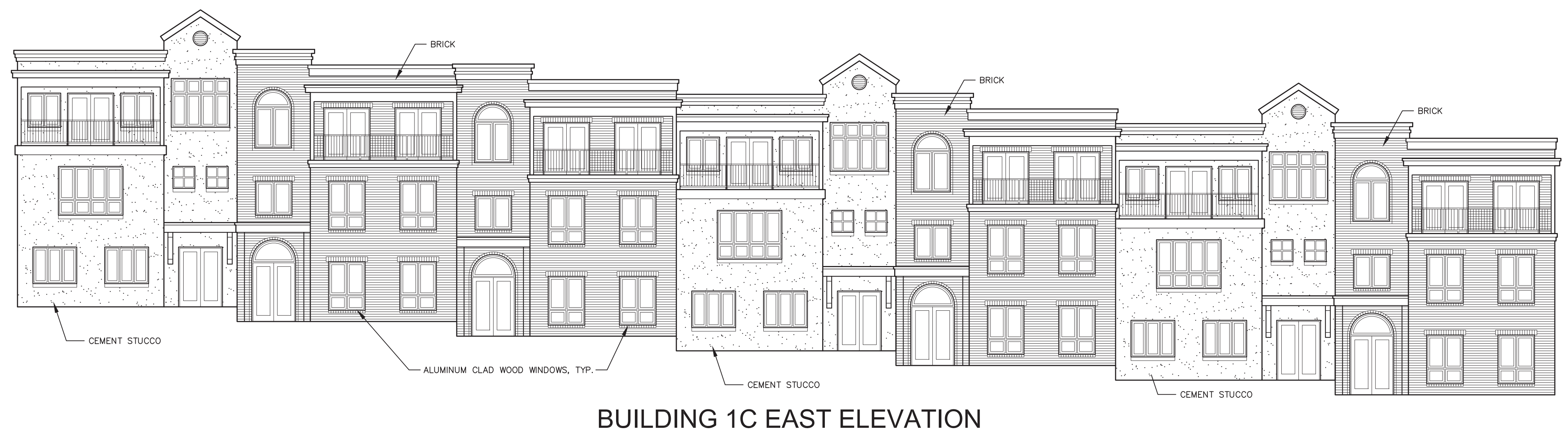
BUILDING 1C EAST ELEVATION