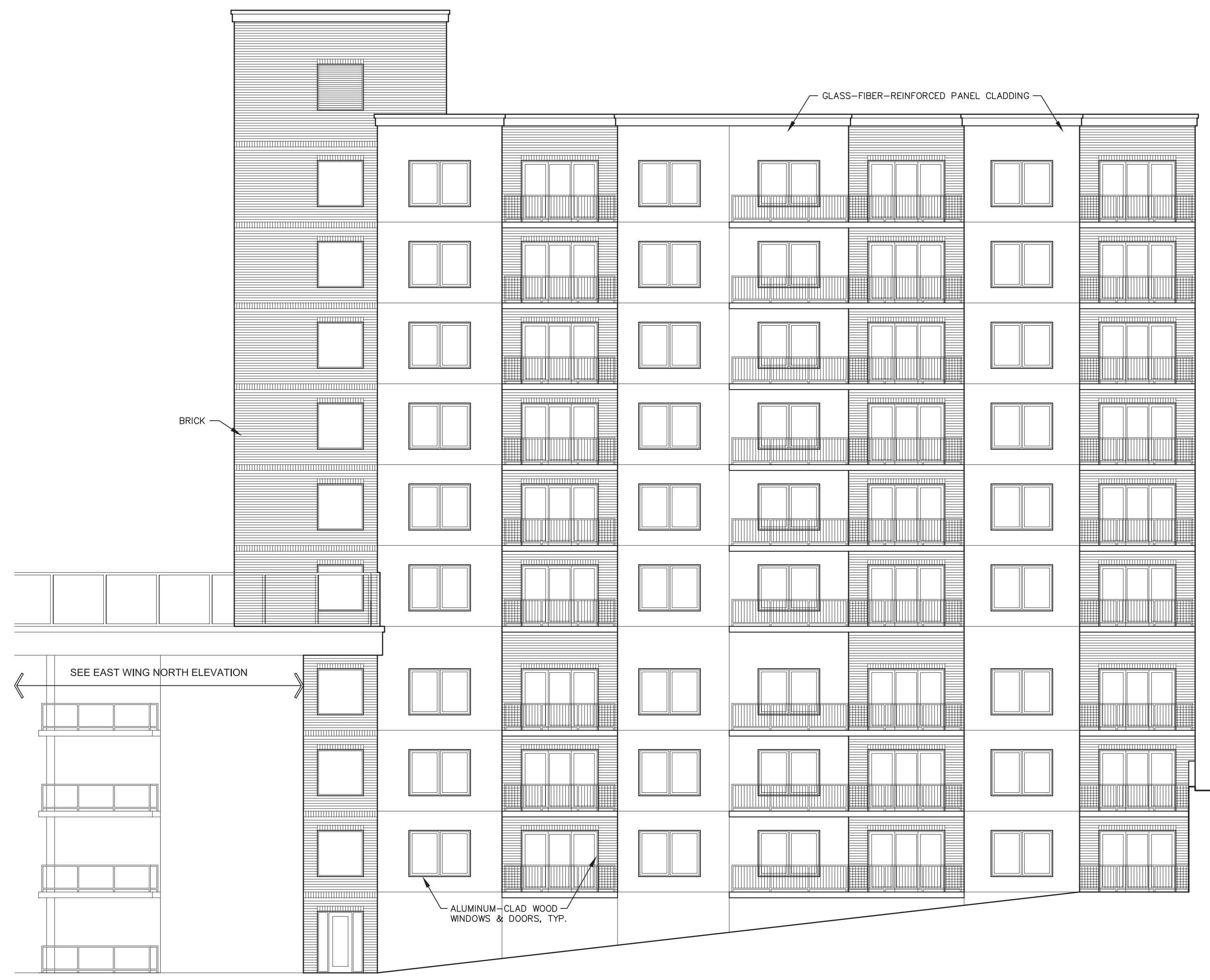
WEST WING - NORTH ELEVATION