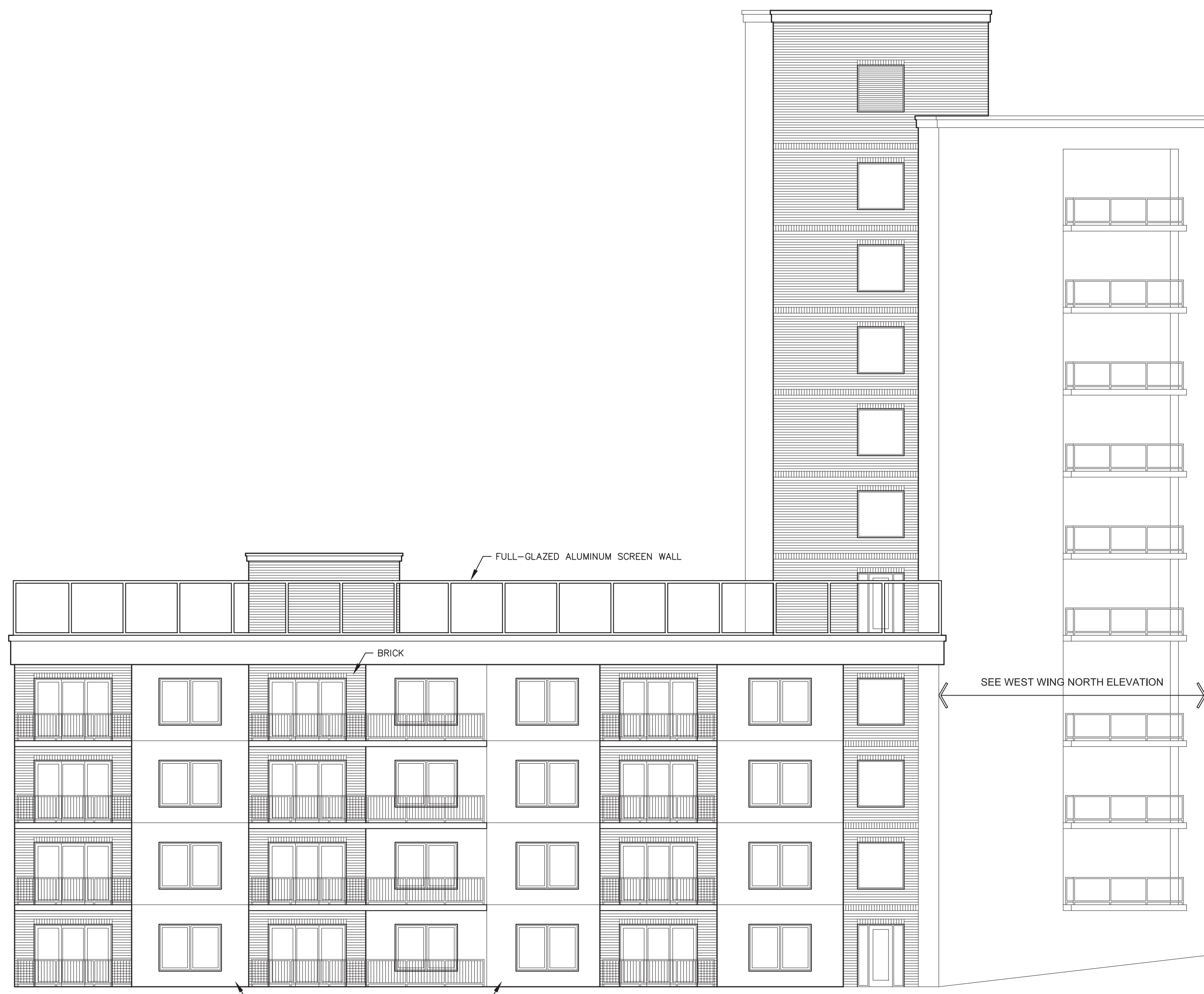
EAST WING - NORTH ELEVATION